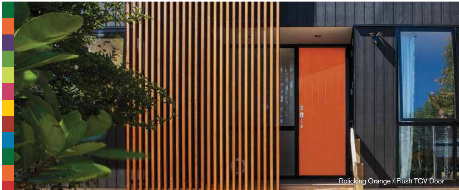
Rolling Orange / Flush TGV Door