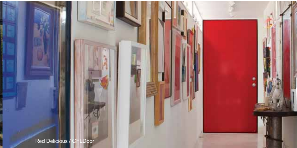
Red Delicious / CFL Door